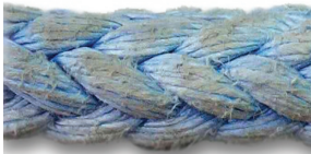
fig. 2 Used rope