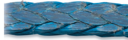
fig. 7 Compressed areas

After numerous “bird cage” cycles the glossy region will become more pliable and begin to resemble normal rope. If the glazed section remains hardened, this could be a sign of heat damage. Heat damaged rope typically has more strength loss than the amount of melted fiber indicates. Fibers adjacent to the melted areas are probably damaged from excessive heat even though they appear normal. It is reasonable to assume that the melted fiber has damaged an equal amount of adjacent unmelted fiber.