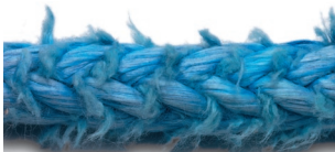
Rope displaying 25% strand volume reduction from abrasion — rope should be retired from service.