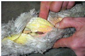
fig. 5 Inspect for internal abrasion