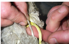
fig. 6 Compare surface yarns with internal yarns