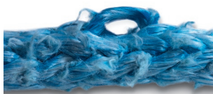
Rope strands reduced by 25% abrasion. Pulled strands should be worked back into the rope so they won't continue to snag and eventually cut.