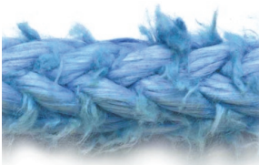
fig. 3 Severely abraded rope