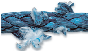
Rope displays two adjacent cut strands. This rope should either be retired or the cut section should be removed and the remaining rope re-spliced.