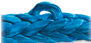
Rope strands showing full volume.