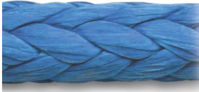
fig. 1 New rope