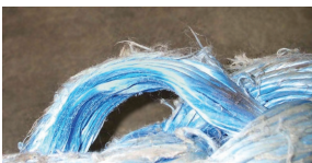
fig. 4 Inspect for internal abrasion

Determining the extent of fiber loss due to abrasion can be difficult. Since all the strands are twisted, the outer fibers, which are the most prone to abrasion damage, rotate through the rope's length. Therefore on a single strand, the fibers that have been abraded on one pick are not necessarily the fibers being abraded on the next. However, over a long distance, a single yarn could have the majority of fiber loss due to abrasion.